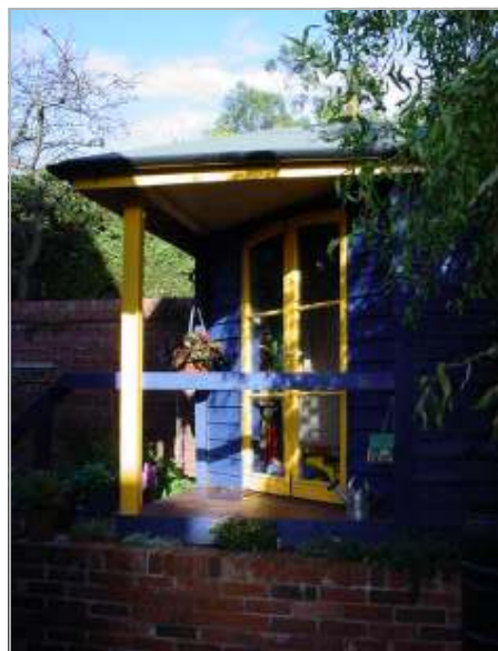
Secluded patio/BBQ area & summer house